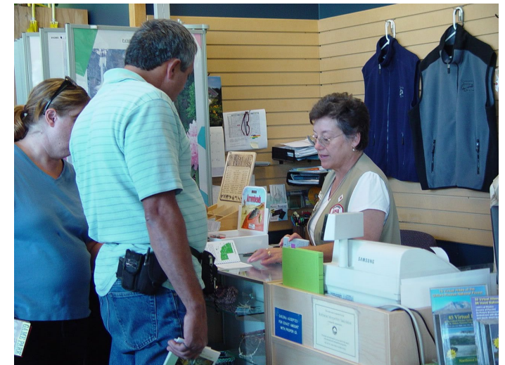
Volunteer selling items at Bonneville L&D – NWP Both of these bookstores operated by the cooperating association, Discover Your Northwest