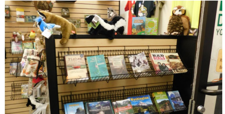
Bookstore items in Lower Granite VC - NWW